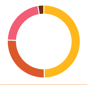
MARKET CAP BREAKDOWN (%)